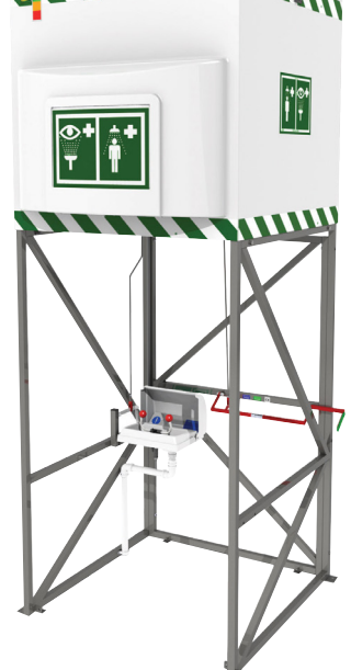
Shown as packed for shipping