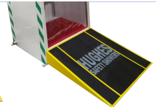
900mm X 1000mm X 215mm for cubicle showers