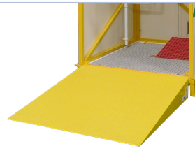
1215mm X 1000mm X 175mm for tank showers/cubicles with sump