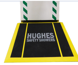
1215mm x 1215mm GRP safe area demarcation zone anti-slip panel