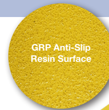
GRP Anti-Slip Resin Surface